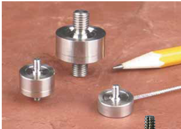
Select ranges in stock