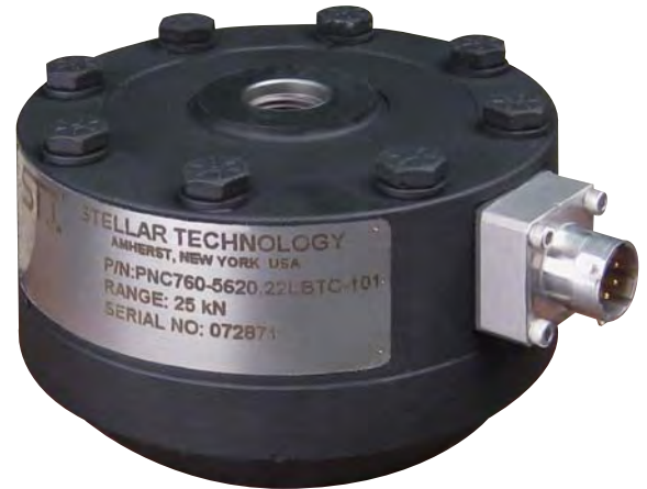
Shown with optional base