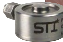
shown actual size