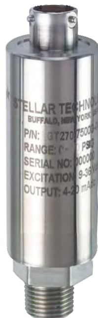
250 PSI and up - 1" Dia.