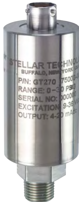
150 - 200 PSI - 1.5" Dia.