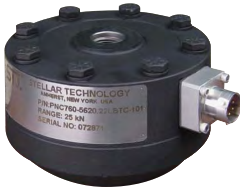
Shown with optional base

Fatigue Rated, Precision Pancake Load Cell